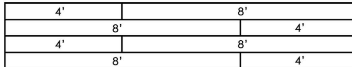
Deck Surface Pattern